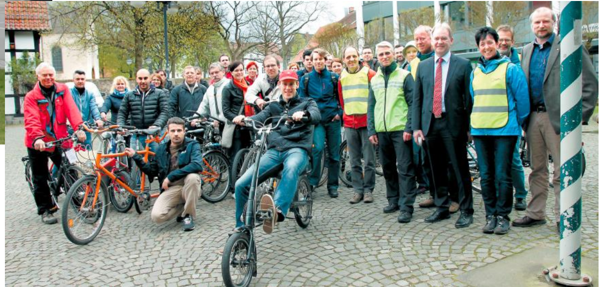
Municipalities (Bünde, DE)